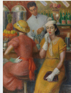
William J. Glackens Soda Fountain, 1935 Oil on canvas Courtesy of the Pennsylvania Academy of the Fine Arts, Joseph E. Temple Fund and Henry D. Gilpin Fund

Be among the first to hear about the NSU Museum of Art Fort Lauderdale's blockbuster exhibition of the 2018-2019 season, William J. Glackens and Pierre-Auguste Renoir: Affinities and Distinctions .